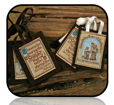
Devotional scapulars are two small rectangular pieces of cloth, connected by narrow bands, and touch the back and chest of the wearers.