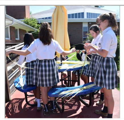
Preparation of palms

Since 2009, the Diocese of Nashville Catholic Schools Office has encouraged each school to have a Social Justice Plan in place that allows every student to experience the importance and joy of serving others. Since our school motto is Learning, Love and SERVICE, this was easy to do here in Murfreesboro. As a Saint Rose School faculty,