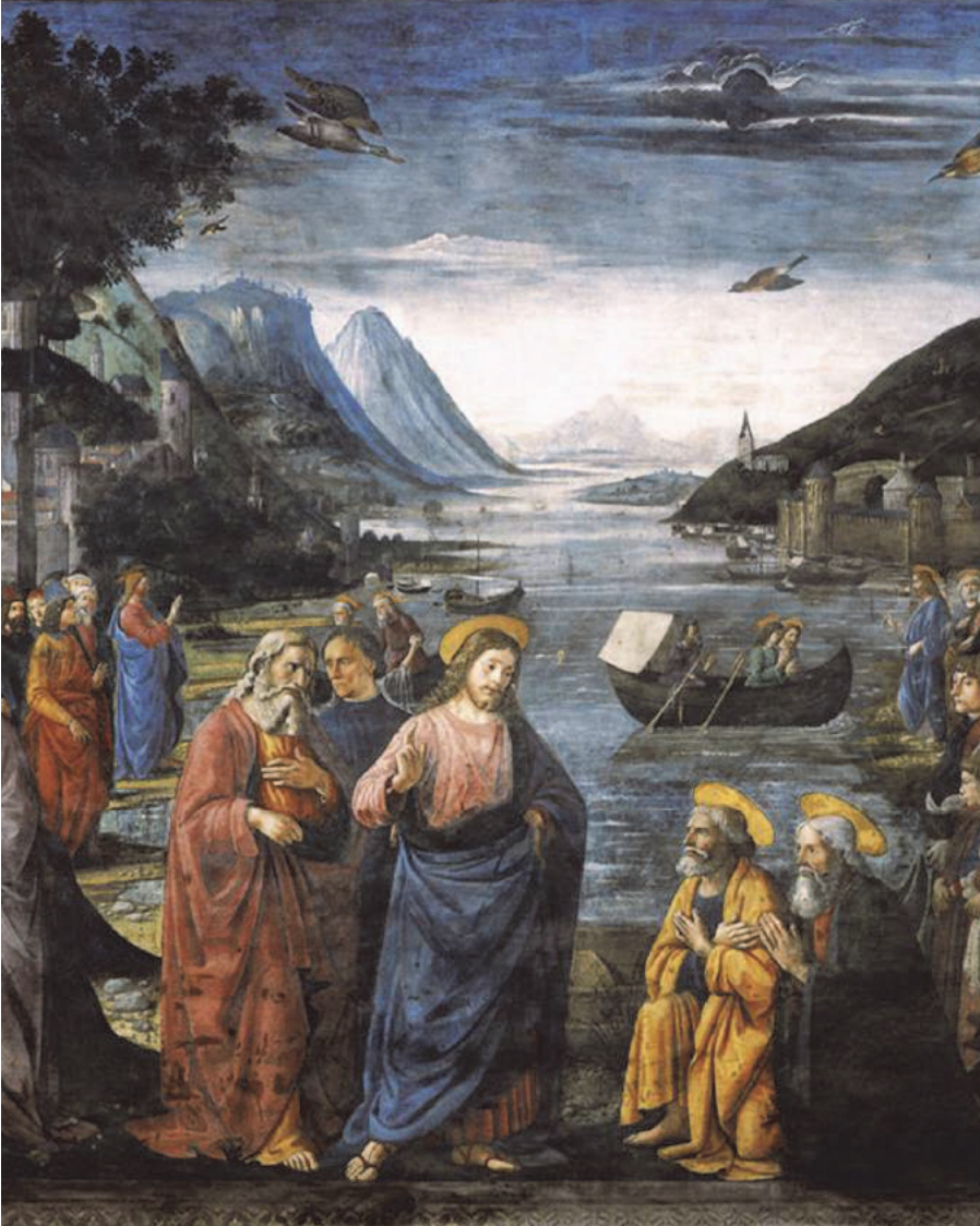
Calling of the Apostles by Domenico Ghirlandaio (detail), 1481